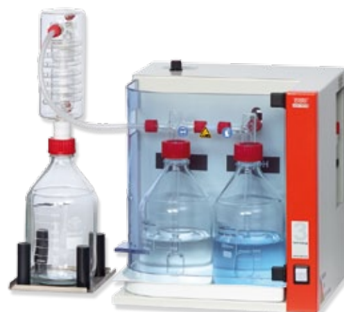
behrosog 3 with ACS